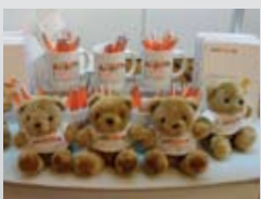
◀ Roadshows on campus