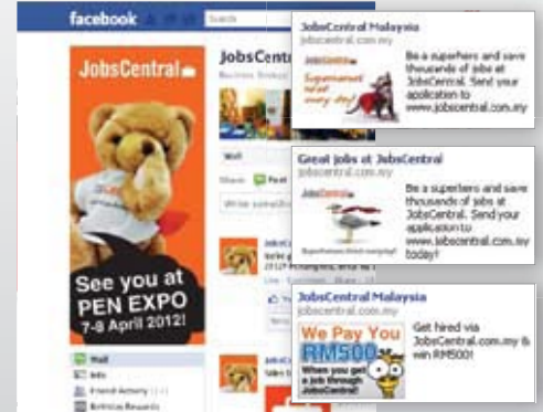
▲ Social Media