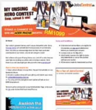
▲ Electronic Direct Mailers