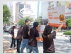
▲ Flash Mobs