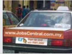
▲ Taxi Ads