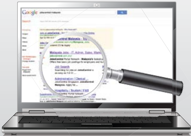
▲ Search and Content Marketing