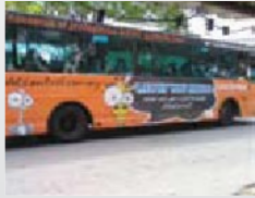
▲ Bus Ads